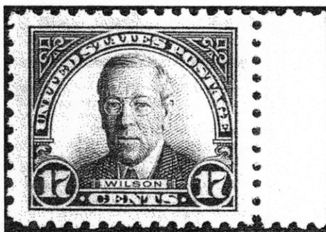
Figure 4. How much is a superb, never-hinged, jumbo-margin stamp worth? The buyer of this 17¢ Woodrow Wilson stamp of 1925 paid more than 57 times catalog value for it. The stamp was offered with a numerical grade.

Then get out your U.S. collection and see if you have any similar stamps: mint never-hinged, original gum, es-