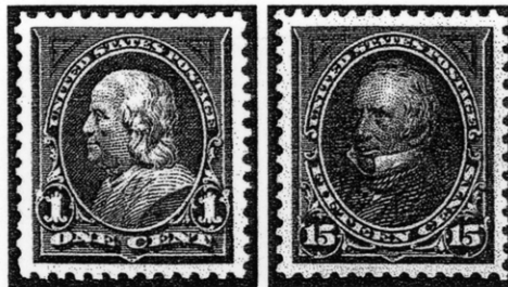
Figure 3. This 1895 1¢ blue Benjamin Franklin stamp (left) sold for more than 13 times catalog value. The 15¢ Henry Clay sold for more than 17 times catalog value. The never-hinged stamps were offered with a numerical grade.