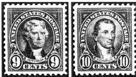
Figure 2. This 1923 9¢ Thomas Jefferson stamp (left) sold for nearly 15 times catalog value. The companion 10¢ James Monroe brought more than 22 times catalog value. Both mint, never-hinged stamps were offered with a numerical grade.

1925 17¢ Woodrow Wilson graded superb 98 jumbo, shown in Figure 4, catalog value $24, sold for $1,380, more than 57 times catalog. ■